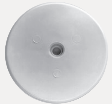
75 mm (3-in.) Locking Plastic Plate