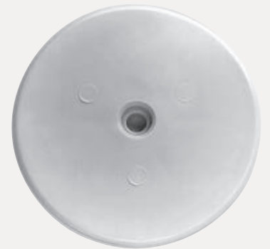
75 mm (3-in.) Locking Plastic Plate