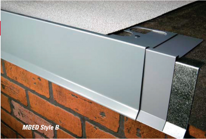
MBED Style B